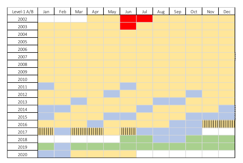
Table 1: Current version: Level-1 v04.