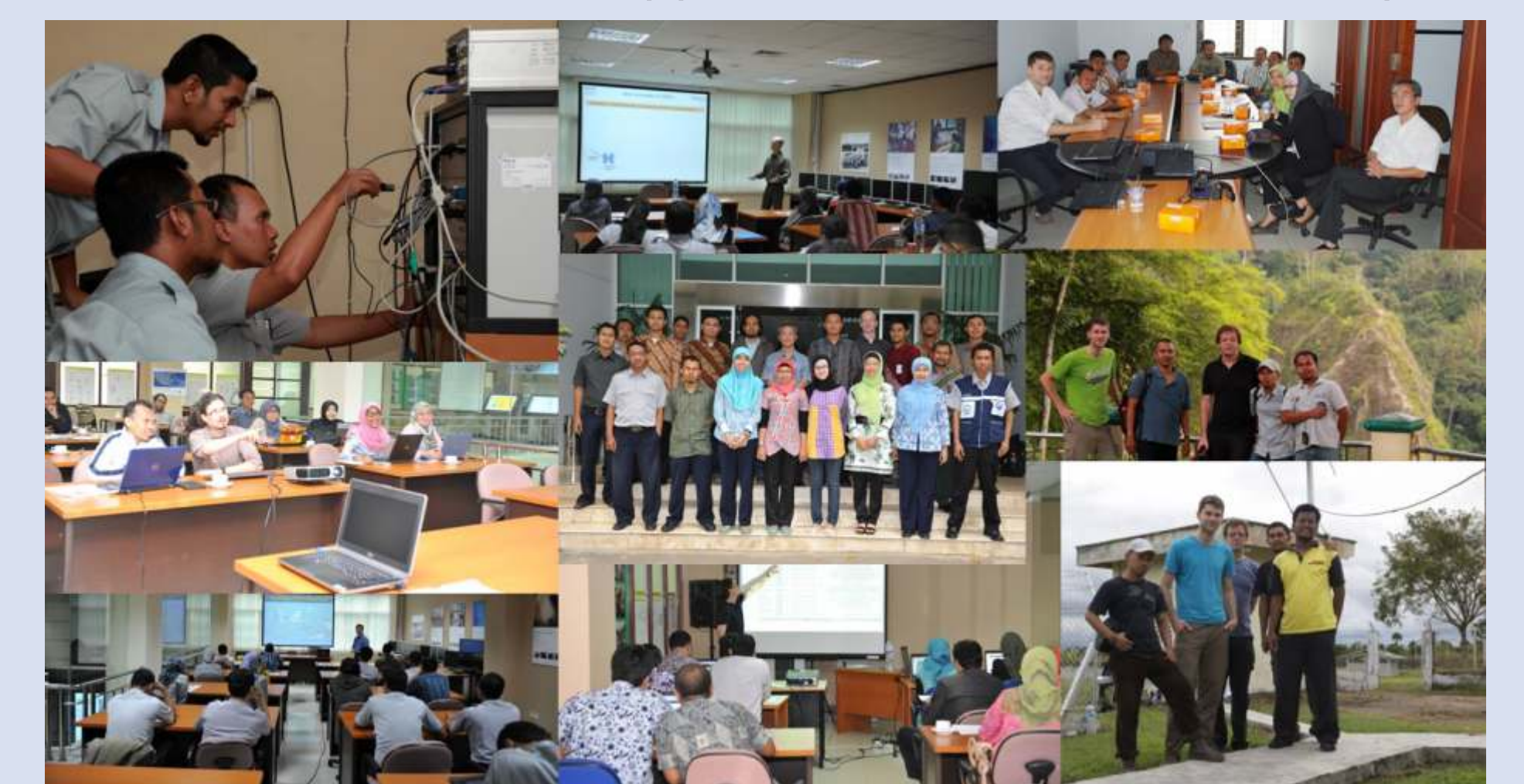
Pictures from training activities related to the Ground Tracking System, operated at the Indonesian Tsunami Early Warning Center in Jakarta since end of 2008

Since the installation of the GTS at the Early Warning Center in Jakarta, GFZ continuously provides technical support and training for the colleagues in Indonesia (Projects GITEWS and PROTECTS). The list of covered topics extends from "real-time reference GNSS-station design" to "GTS system administrator training". Training and software updates for the GNSS processing kernel is offered, independently from GFZ, by the BERNESE team in Switzerland, which supports the GTS's sustainability.