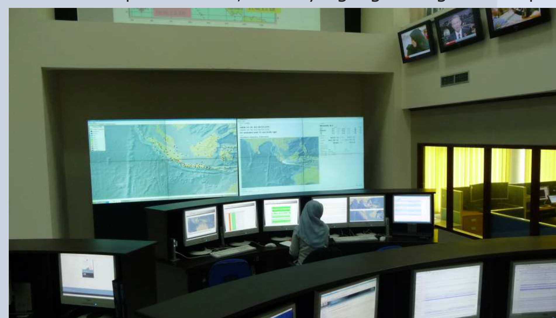
GTS operator desk at the Indonesian Tsunami Early Warning Center

The GTS allows a co- and post-seismic tide gauge position monitoring, which is mandatory before using tide gauge data for early warning tasks. The GTS also supports an improved earthquake parameter estimation, which is useful especially in cases of very strong earthquakes. Interfaces are provided for other warning center components, e.g., wall displays and a decision support system. Additional input, e.g., earthquake parameter from a SeisComP3 system, can be displayed together with detected displacements, overlaying digital regional maps.